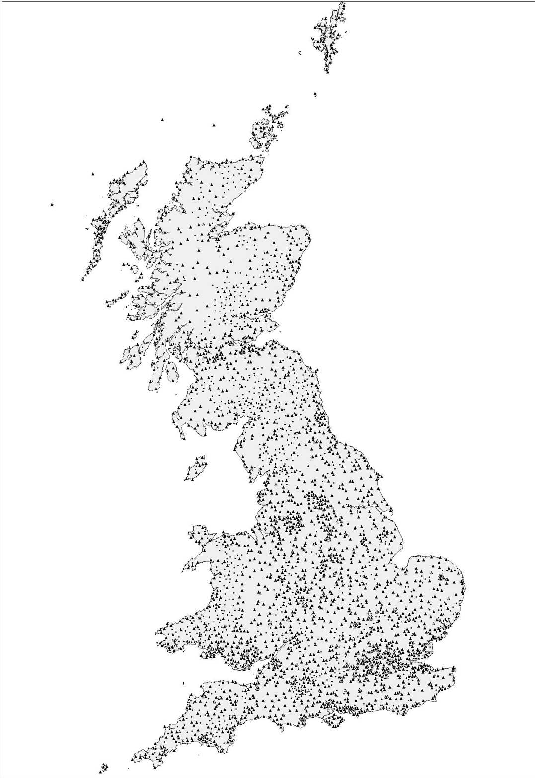
Fig. 3. Final transformation data set.

Triangles represent points with ETRS89 coordinates directly observed with GPS. Dots represent points from the Retriangulation readjustment.