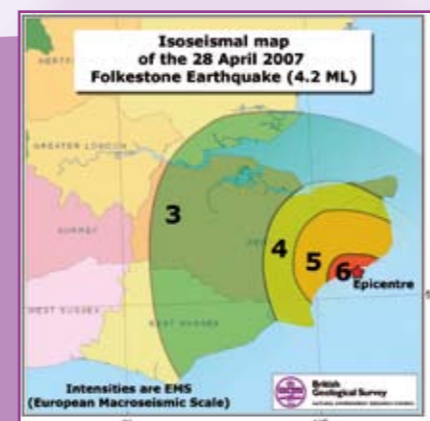
Figure 1 – Isoseismal map of the 2007 Folkestone earthquake

Each contour is drawn in such a way as to enclose as many places as possible that have the same intensity, while not including too many that have a lower intensity, and trying to keep the curves smooth. The resulting lines are called isoseismals (lines of equal shaking). Usually, these lines tend to form ellipses.