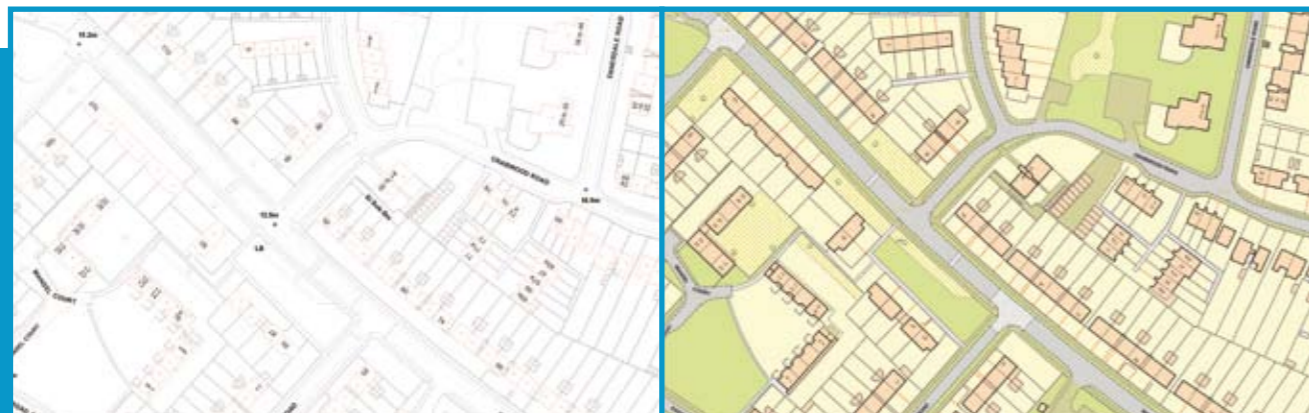
Land-Line data (left) is now being replaced with OS MasterMap data (right).

Data that schools are already authorised to access via their local authorities is included in MapPilot. However, we have not included data that is in the process of being migrated to new products. For example, the pilot does not include Land-Line® data as this is now being migrated to OS MasterMap®.