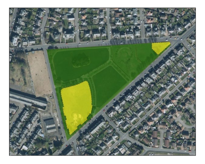
Figure 2: Satellite image of a Greenspace Site with two nested sites.

Where more than one Function is identified within a greenspace, nesting is used. This means that where sites overlap, or where a whole site is contained within a larger site, they are published as separate polygons that overlap one another. For example, in the image below, the whole park including the play areas (green polygon) is captured as one site. The play areas (yellow polygons) are captured separately, and these sites overlap with the park.